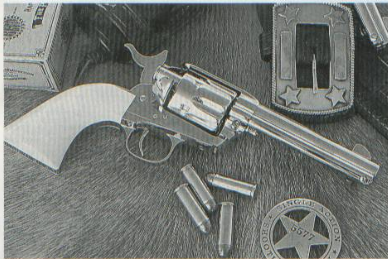
With custom cylinder flutes and period radiusing, Peacemaker Specialists' matching Colts are tastefully dehorned on their exterior.

modifies the bolt to tighten the cylinder fit and eliminate skipping, after which he refits the hand to adjust out over-travel.