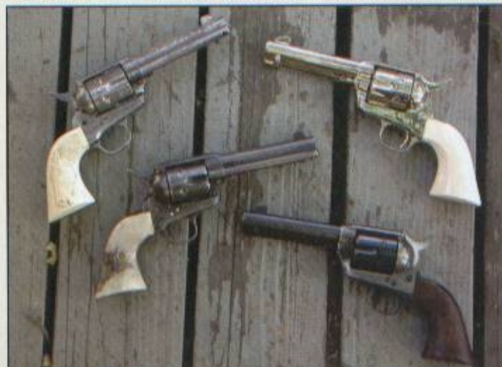
Four 4-3/4" .45 Colt Single Actions representing 1 st , 2 nd , and 3 rd Generation Colts all totally reworked by Peacemaker Specialists.

People often ask if the parts of Italian replicas are interchangeable with Colt parts. The answer is yes and no. There are some Colt Single Action parts that will fit Italian sixguns, however, unless it is a dire emergency I would not even consider placing Italian parts in genuine Colt sixguns. Even Colt parts are not always interchangeable. There are differences from 1st to 2nd to 3rd Generation, and although 2nd Generation parts are often found, many of the 1st Generation parts are slightly different. Interior parts need to be subtly different to expertly