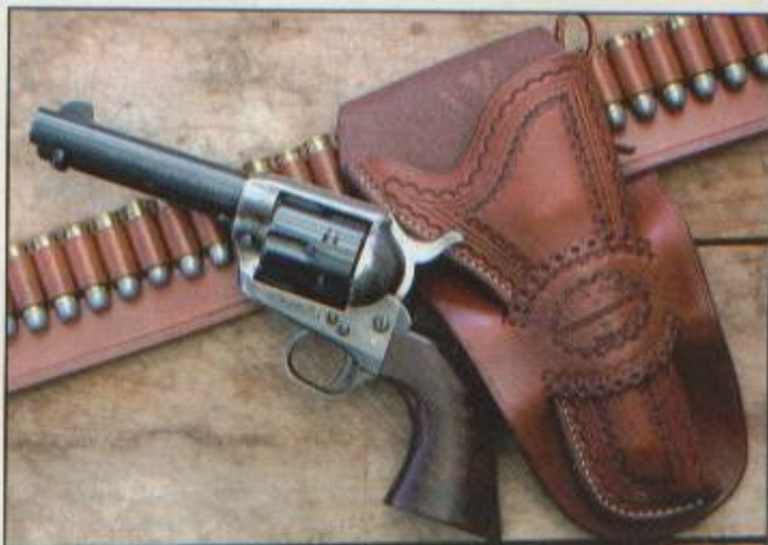
An everyday working sixgun, a 2 nd Generation .45 Colt perfected by Peacemaker Specialists. Leather is by Texas Jack's.

If one is careful, pays attention, lives a good life, it's not too unlikely he will run into an old Colt Single Action Army at a good price. I know if the frame is in good shape, everything else can be replaced by Peacemaker Specialists. They can definitely turn the silk purse trick. Whether one is looking for Colt Single Action Parts for any generation, a master tune up, or a total rebuild, Peacemaker Specialists can be found at P.O. Box 157, Whitmore CA 96096 or call them at (530) 472-3438. Send $4.00 for a complete catalog.