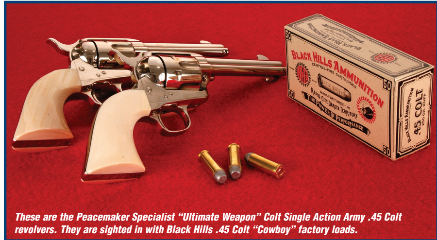
These are the Peacemaker Specialist "Ultimate Weapon" Colt Single Action Army .45 Colt revolvers. They are sighted in with Black Hills .45 Colt "Cowboy" factory loads.

Let's look at the accuracy thing first. Colt SAAs, especially in .45 Colt caliber don't have a sterling reputation for accuracy. This is mostly caused by Colt mounting them with barrels of .451" groove diameter, but cutting the