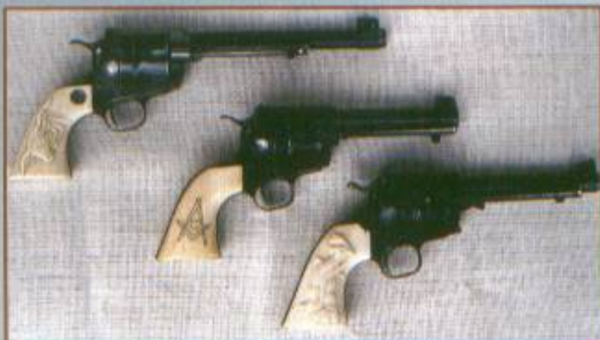
Three famous Colt Single Actions sixguns that were the daily working sixguns of Elmer Keith for three decades. See the article for the details on these ivory-stocked Colts.

When I first started thinking seriously about sixguns, there was very little in print and certainly nothing as exotic as the Internet for gathering information. We take gun magazines for granted today, but the only thing available in the early 1950's was the American Rifleman , and sixgun articles were few and far between. The gun magazines began to appear with the first issue of Guns arriving in January of 1955. My heart almost stopped, I know it at least skipped several beats, when I saw that first issue on the newsstand. Three years later, Guns & Ammo debuted as a quarterly, followed by Gun World in 1960, and Shooting Times being offered first in newspaper form before it became a magazine. The first magazine strictly for handgunners, American Handgunner , arrived in 1973, and, of course, SHOOT! MAGAZINE is still relatively new and ready to start its fourth year in publication. It is unique in being directed at cowboy action shooting and all the related equipment that goes along with this great sport.